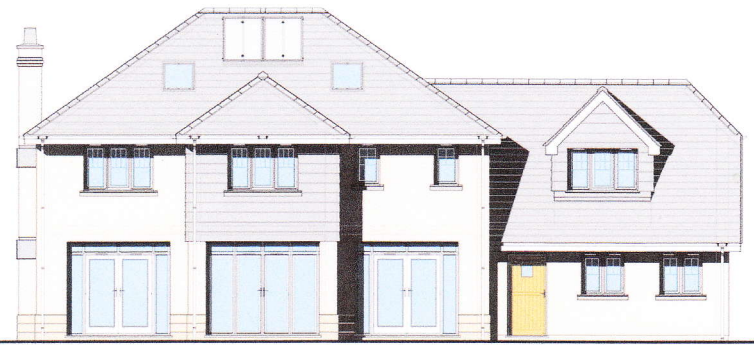
PROPOSED SOUTH WEST FACING ELEVATION @ 1:50

SCALE 1:50 @ A1 DATE August 2011 DRAWN DJH CHECKED JHR