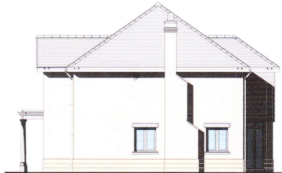
PROPOSED NORTH WEST FACING ELEVATION @ 1:50