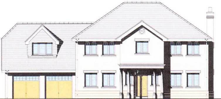
PROPOSED NORTH EAST FACING ELEVATION @ 1:50

NOTES 1. ALL WORK TO BE IN ACCORDANCE WITH THE BUILDING REGULATIONS 2010. 2. ALL WORK TO BE IN ACCORDANCE WITH THE PLANNING PERMISSIONS GRANTED. 3. ALL WORK TO BE IN ACCORDANCE WITH THE LOCAL AUTHORITY REQUIREMENTS. 4. ALL WORK TO BE IN ACCORDANCE WITH THE NATIONAL BUILDING REGULATIONS 2010.